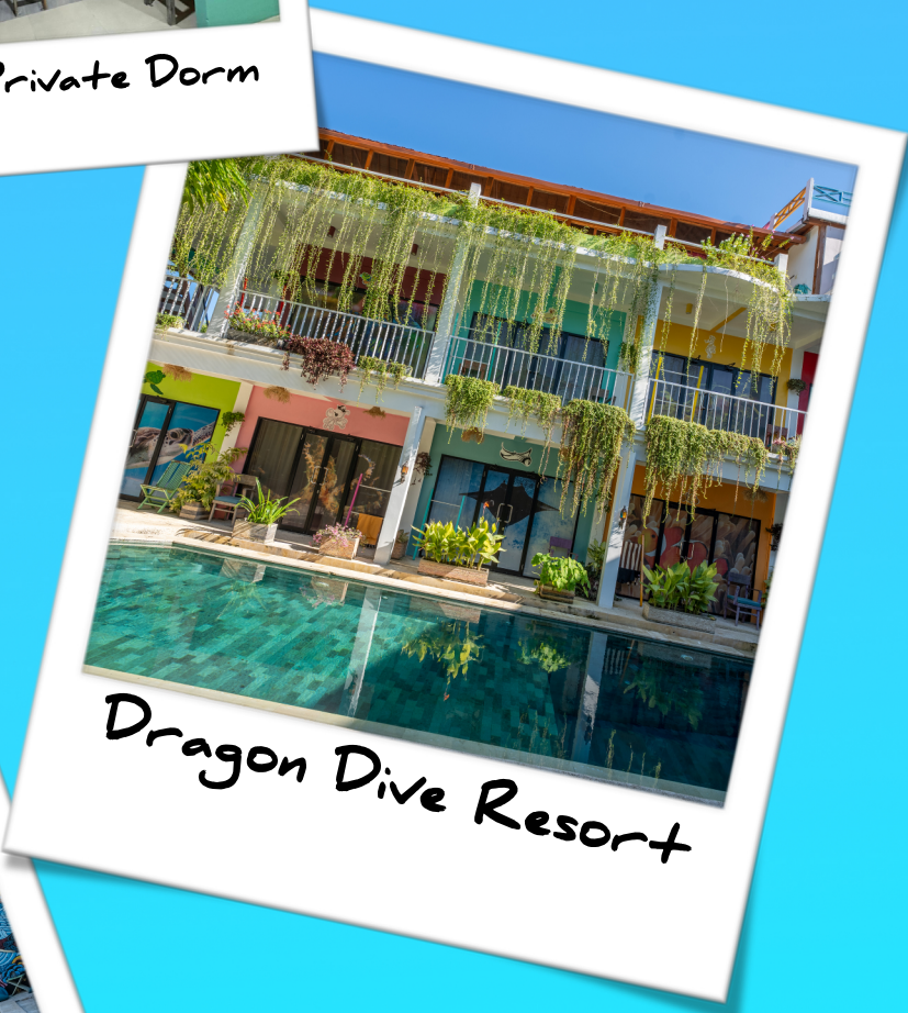
Dragon Dive Resort