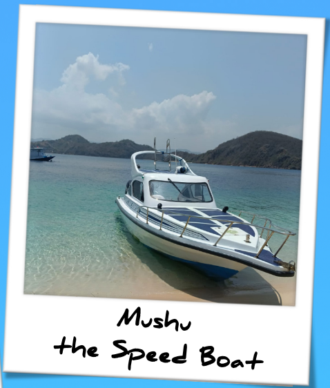
Mushu the Speed Boat