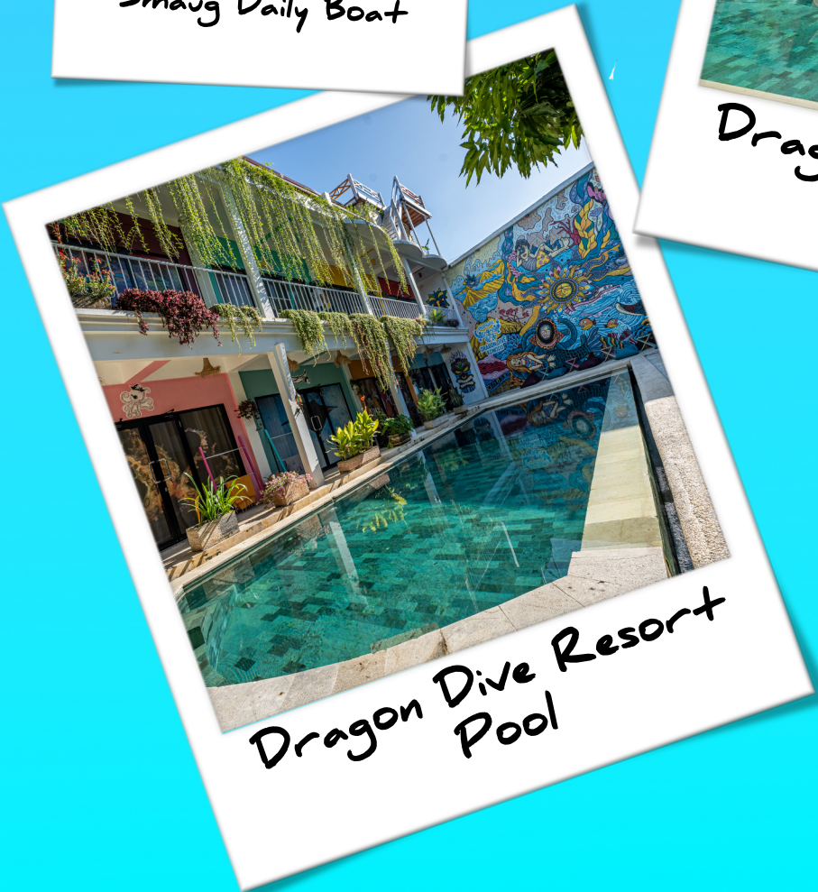
Dragon Dive Resort Pool