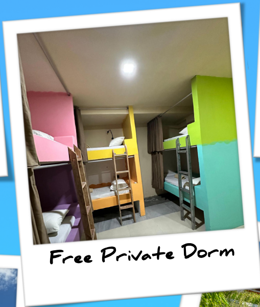
Free Private Dorm