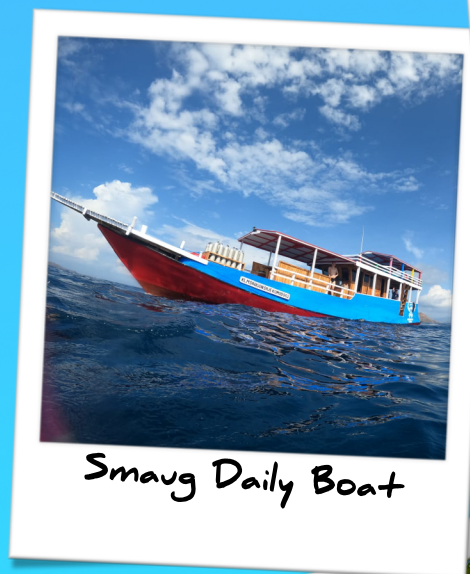
Smaug Daily Boat